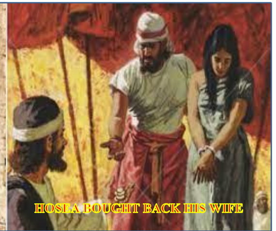
HOSEA BOUGHT BACK HIS WIFE

Hosea is referred to as the “ prophet of love ” because his messages centred on God’s love for the children of Israel in spite of their unfaithfulness. His marital experience served as a practical example to his message of love. His message was against immorality, political and religious corruption. He encouraged the people to repent and turn back to God. His period of prophecy spread through the reigns of king Uzziah, Jothan and Ahaz in the southern kingdom and Jeroboam in the northern kingdom.